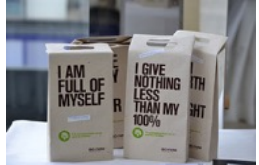
Good Paper Project - entered into Design for Packaging in 2013