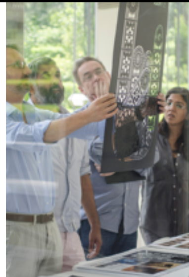
Sufi Rock - entered into Design Craft - Graphic Design in 2013