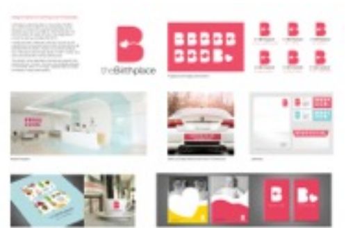
Branding a Birthing Center - entered into Design for Identity in 2013