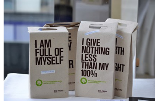
Good Paper Project - entered into Design for Packaging in 2013