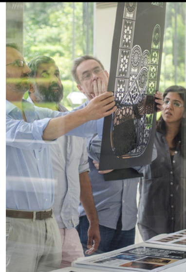
Sufi Rock - entered into Design Craft - Graphic Design in 2013